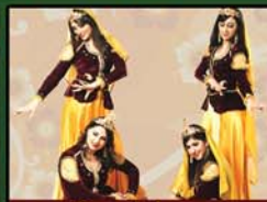
BESHKAN DANCE ACADEMY