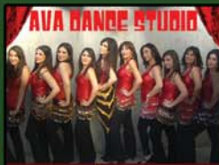
AVA DANCE STUDIO